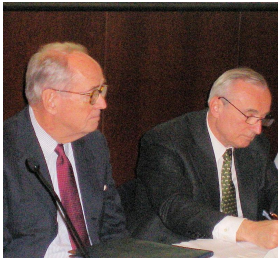
Hons. Richard Thornburgh & William Bratton